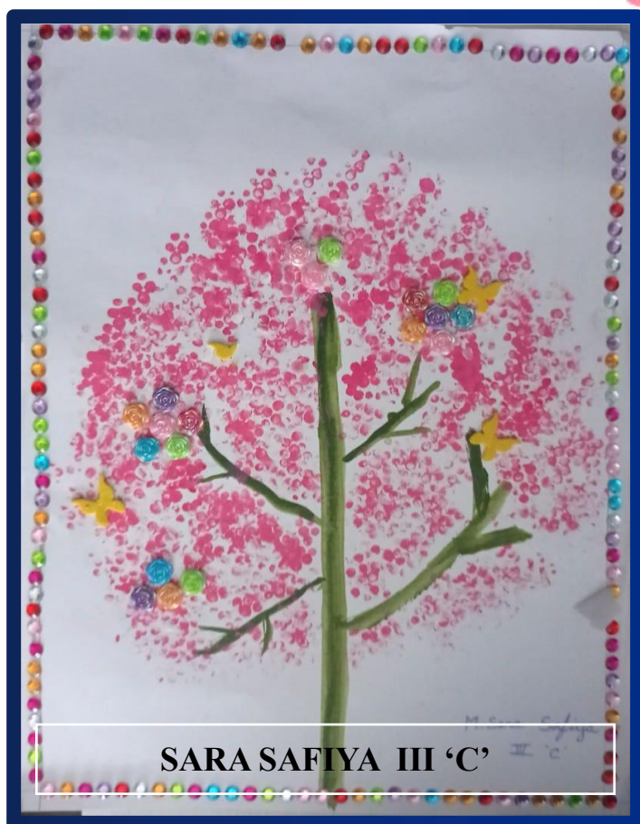
SARA SAFIYA III 'C'