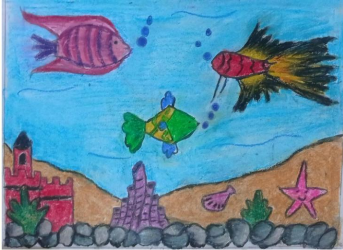
MOHAMMED RAYYAN II'C'

"Education is the most powerful weapon which you can use to change the world."