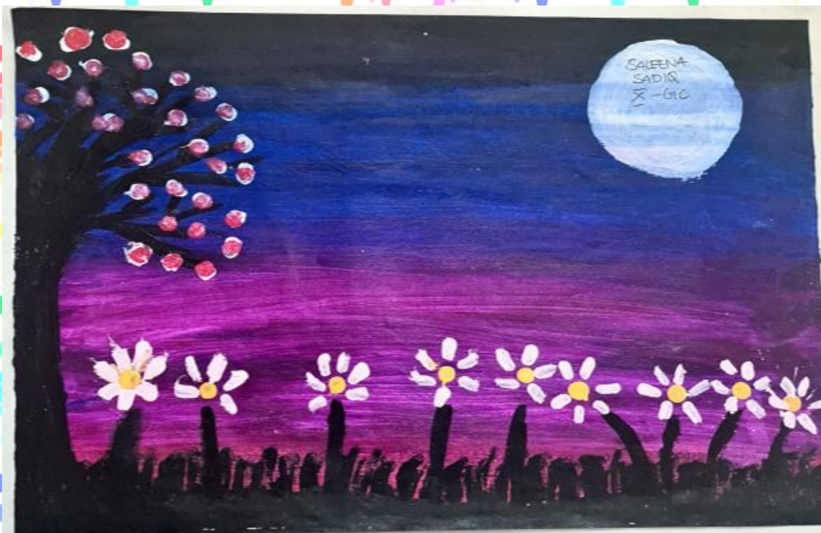
SALEENA SADIQ X 'GC'